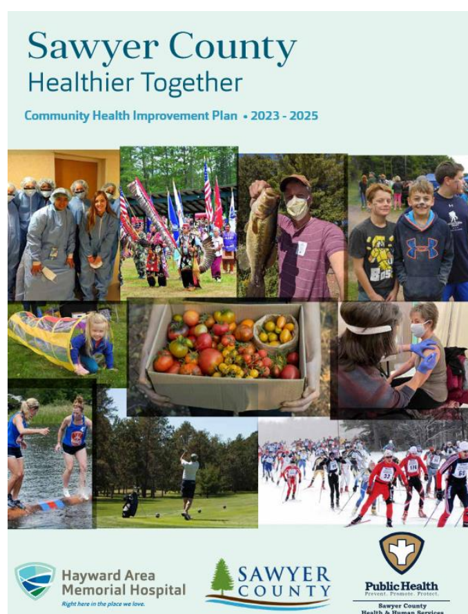
Figure 1. Front cover of the Sawyer County CHIP plan.